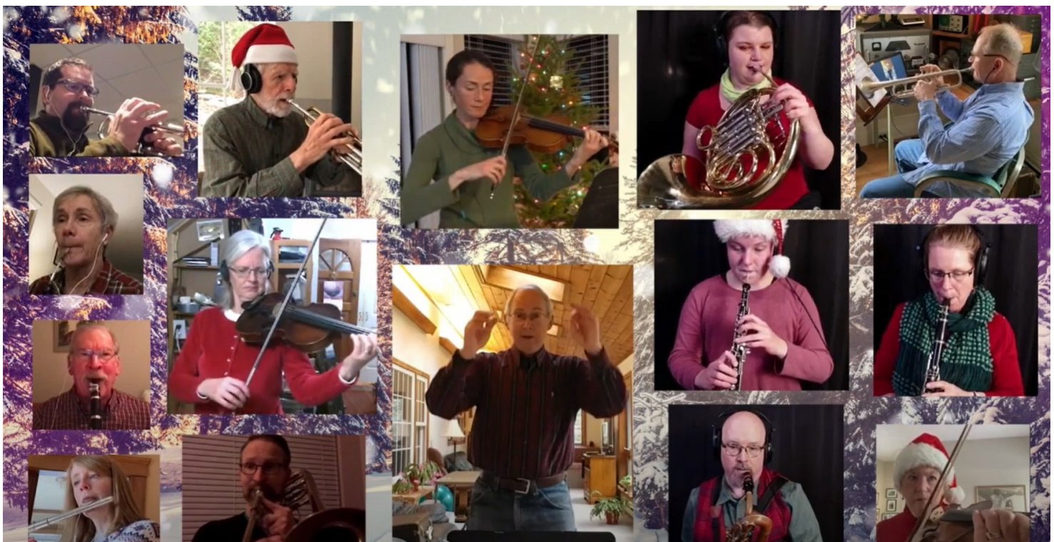
The Holiday Orchestra on Zoom during the Covid shutdown.