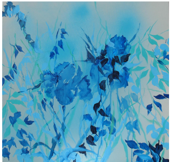
Soft Irises, acrylic, 36x36"