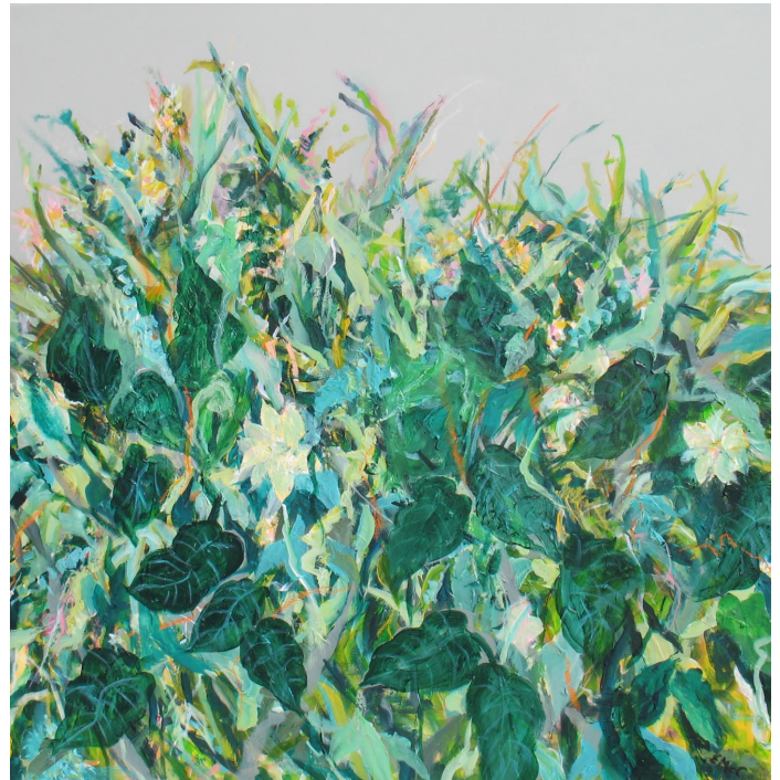
Greeny, acrylic, 36x36"

Ed McCartan's work often travels full circle, returning to themes he's experimented with before: nature in all its forms, flowers, seed pods, small, overlooked things rich in possibilities. He also enjoys exploring subjects alive with color and design that dance and play. He tries to stay open to all of it, seeing it as an ongoing journey.