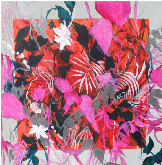
Candy, acrylic, 20x20"