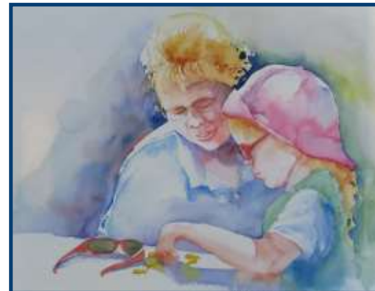
The Red Sunglasses