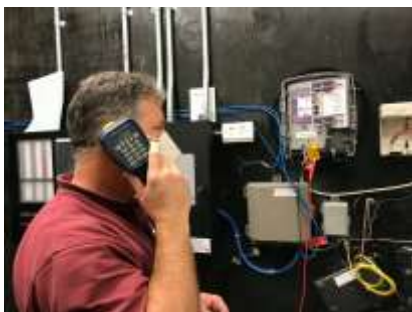
The new fiber line has dramatically improved upload and download speeds, averaging around 50 MB/s.

Although we have been very successful in producing recorded virtual services (big thanks to Jud), our long-term plan includes establishing the ability to stream services and events live from the church. We had preliminary discussions about this prior to the pandemic, and since it will be a long time before we can all gather in church, we hope to add streaming as an option while we continue to stay safely distanced. Eventually, we expect to have live streaming available as part of our normal Sunday routine—even when the pandemic is history. In order to make that possible we have upgraded our internet