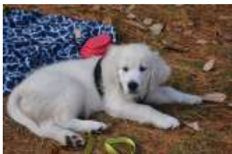
Poppy, the Berniers' puppy, takes a break at the picnic