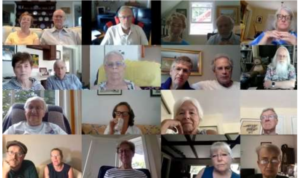
Here are some of the participants in a recent Coffee Hour get-together on Zoom. See page 3 for more information on our virtual Coffee Hours.