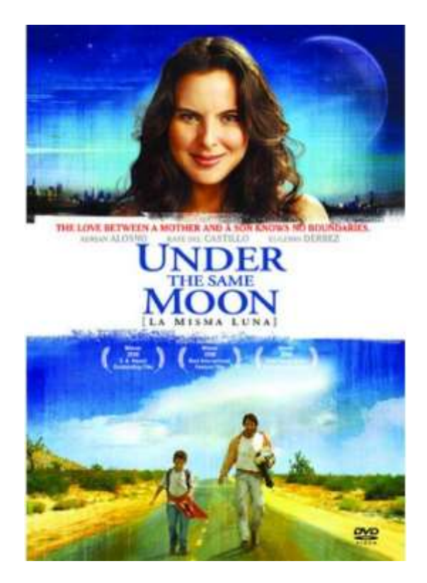
Sunday, Nov. 10 at 11:30 in the Sanctuary