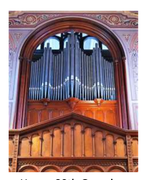
Happy 80th Grace!