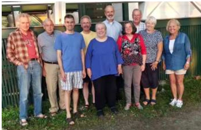
Happy Board members at the end of our retreat and delicious potluck dinner.

ue to thrive and function effectively with reduced ministerial hours.