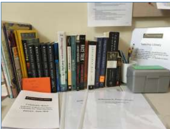
The Working for Justice table has lots of important information and resources.