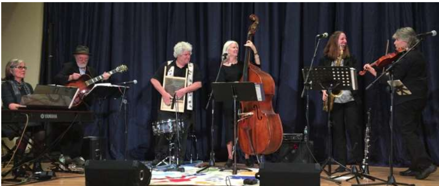
On November 10th, Honest Millie, a 6-piece swing jazz band entertained a very delighted audience with their instruments and harmonies and song choice. Some dancers were even spotted dancing in the back of the sanctuary. Concerts for a Cause earned about $500 for the church and this year's charities: The Gathering Place and the Brunswick Teen Center.