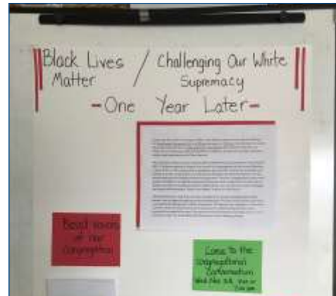
One Year Later—Still Calling for Action