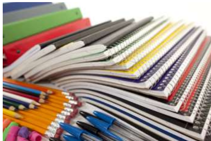
The Teen Center Support Group

Any cash collected will be used to provide a meal in September and school supplies. A table will be set up in Fellowship Hall on Sunday, September 2 with a place for donations of cash or checks and supplies. Someone from the TC Support Group will be there to answer any questions. Thank you!