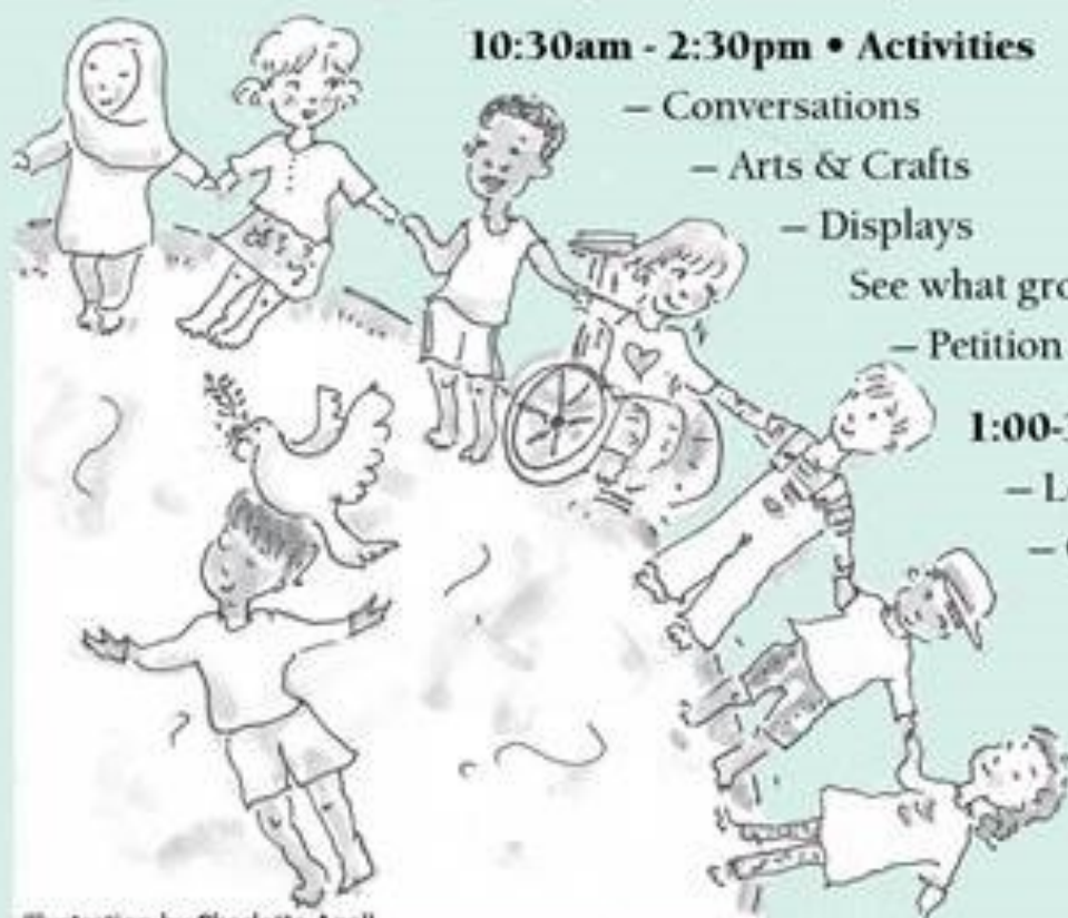
Illustration by Charlotte Agell