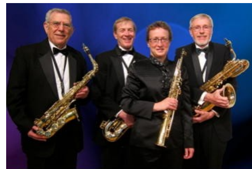
Cul de Sax, August 12

You can also see them August 16 at the Harpswell Band Stand.