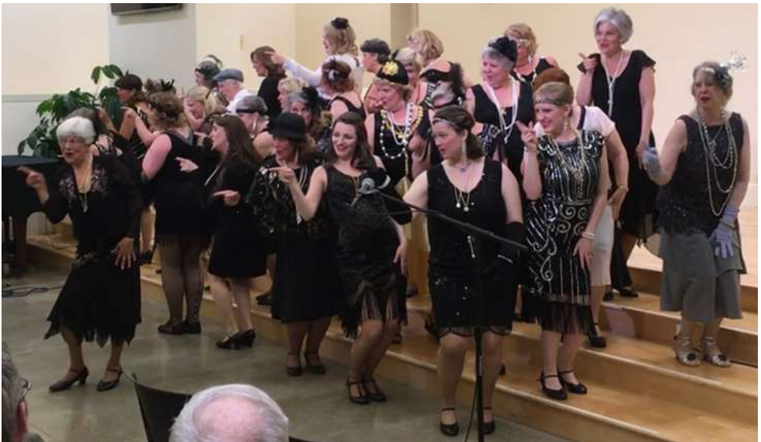
Royal River Chorus