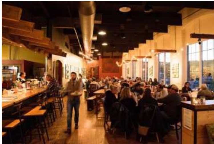
The Frontier Cafe Fort Andross, 14 Maine St, Brunswick

If you wish to suggest a restaurant, please email taffydrake@gmail.com or sedadamour@msn.com with subject "Reservations for 8".