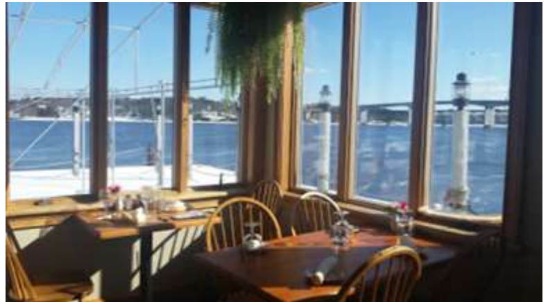
Kennebec Tavern 110 Commercial St, Bath