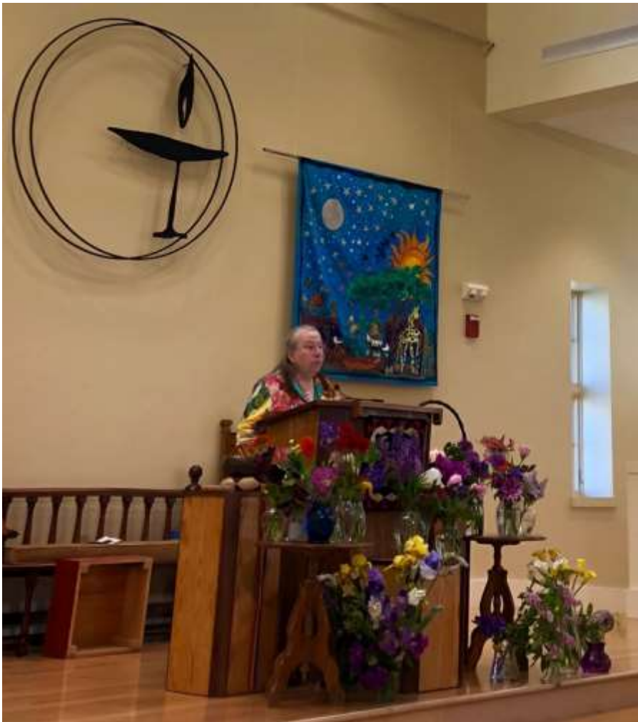
The pulpit adorned with beautiful flowers during the Annual Flower Ceremony