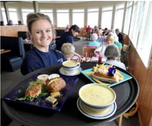
The Dolphin Marina & Restaurant 515 Basin Point Rd, Harpswell

Reservations will be made for you at the Dolphin, Kennebec Tavern, or the Frontier for 6pm . The Signup sheet will be outside the kitchen.