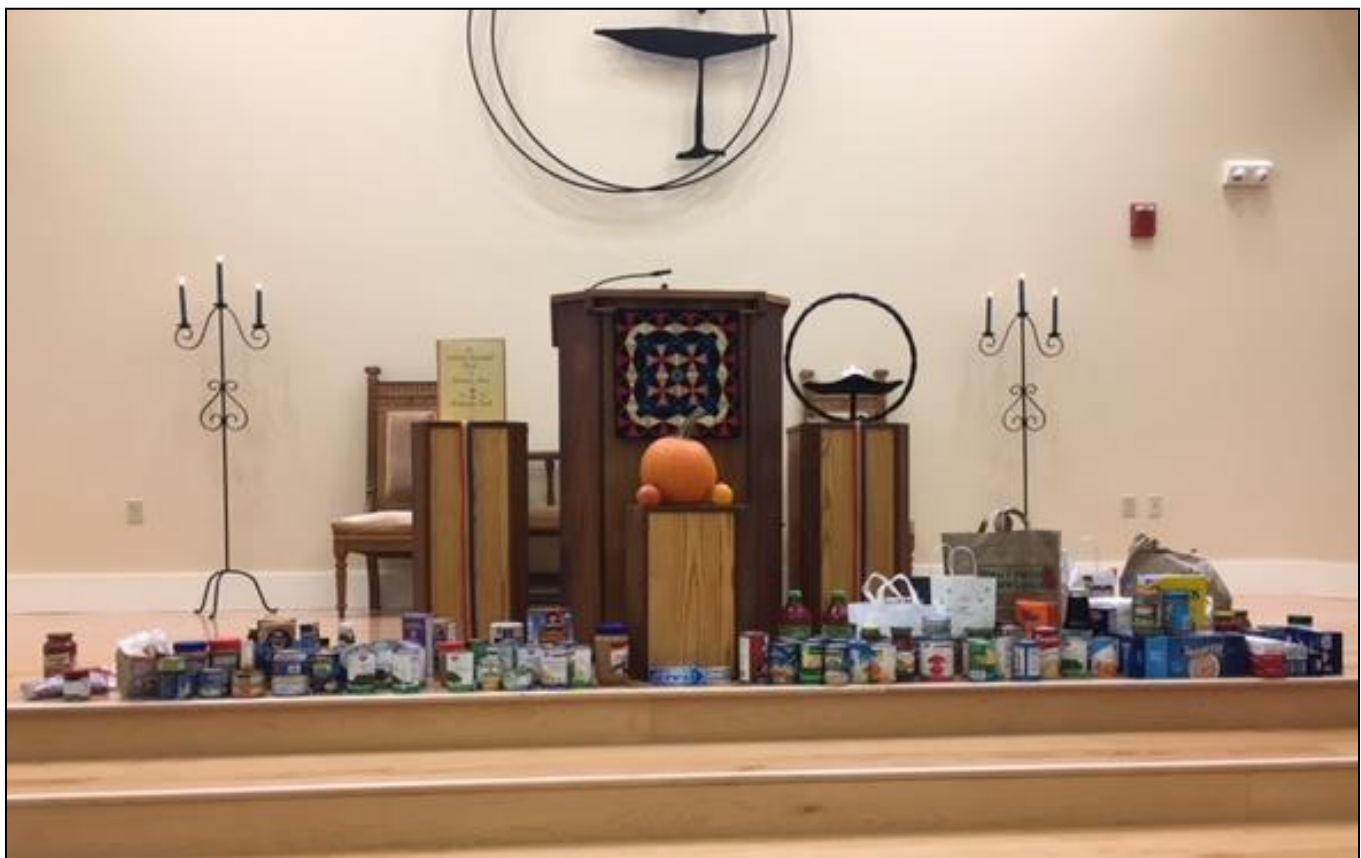
Our food offering for the Midcoast Hunger Prevention Program at our November 19th service