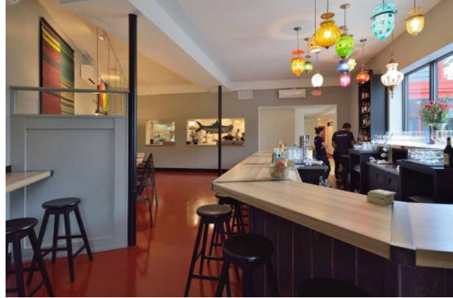
Salt Pine Social, Bath, ME