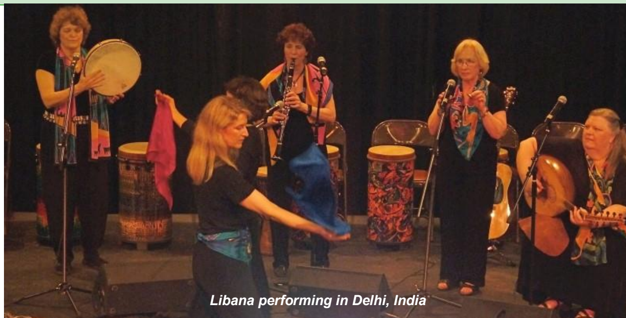
Libana performing in Delhi, India