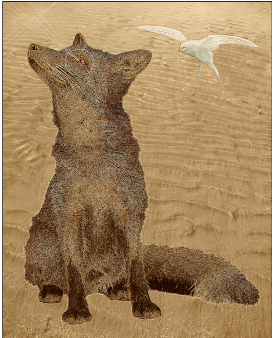
"HALLUCINATIONS"