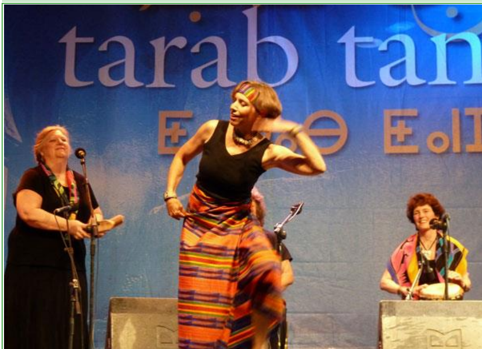
Libana performing at the Tarab Tanger Festival in Morocco