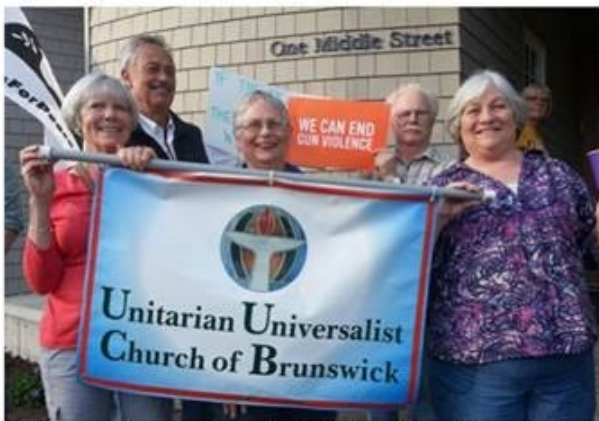
UUCB supporting LGBT community at Orlando walk/vigil June 15, 2016