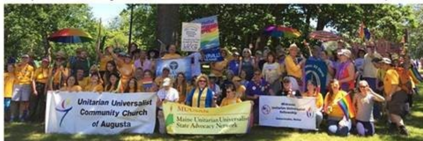
MUUSAN with dozens of UUS from Maine Congregations - Pride Portland 2016