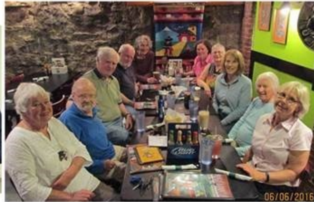
Members of WFJSG Year End gathering June 2016