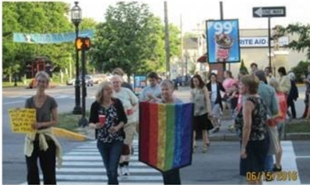
Members of UUCB and greater Brunswick community vigil for Orlando