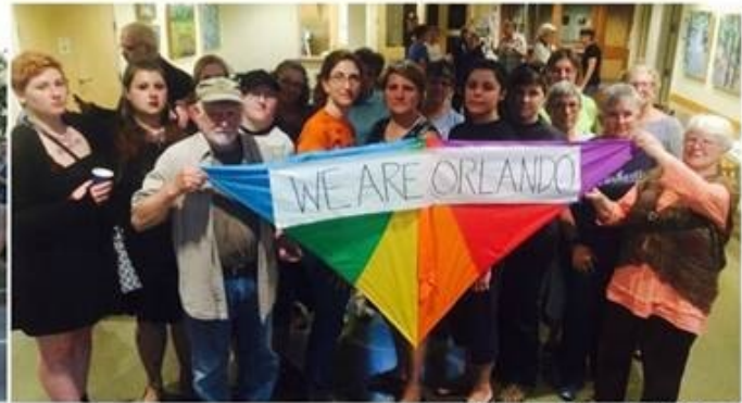
Members of greater Brunswick LGBT and allies - in Fellowship Hall UUCB June 15