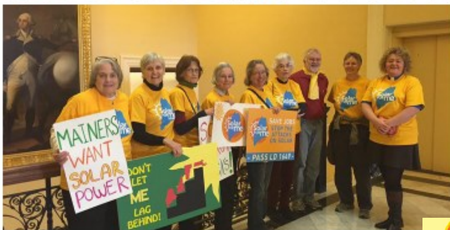
MUUSAN Solar Rally in process.