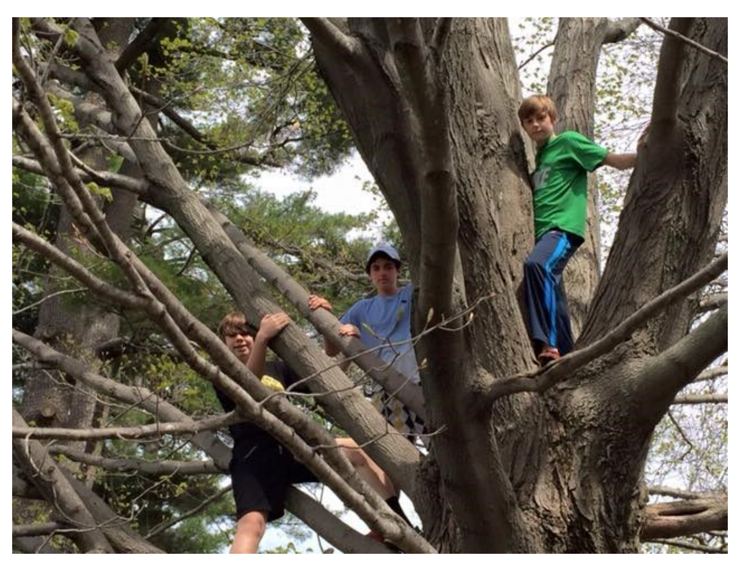
Youth Group shenanigans after a Sunday service.