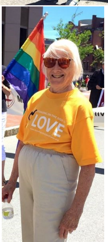
FOLIAS Unitarian Universalist Church of Brunswick

Next MUUSAN Meeting: July 11 Augusta UU Church