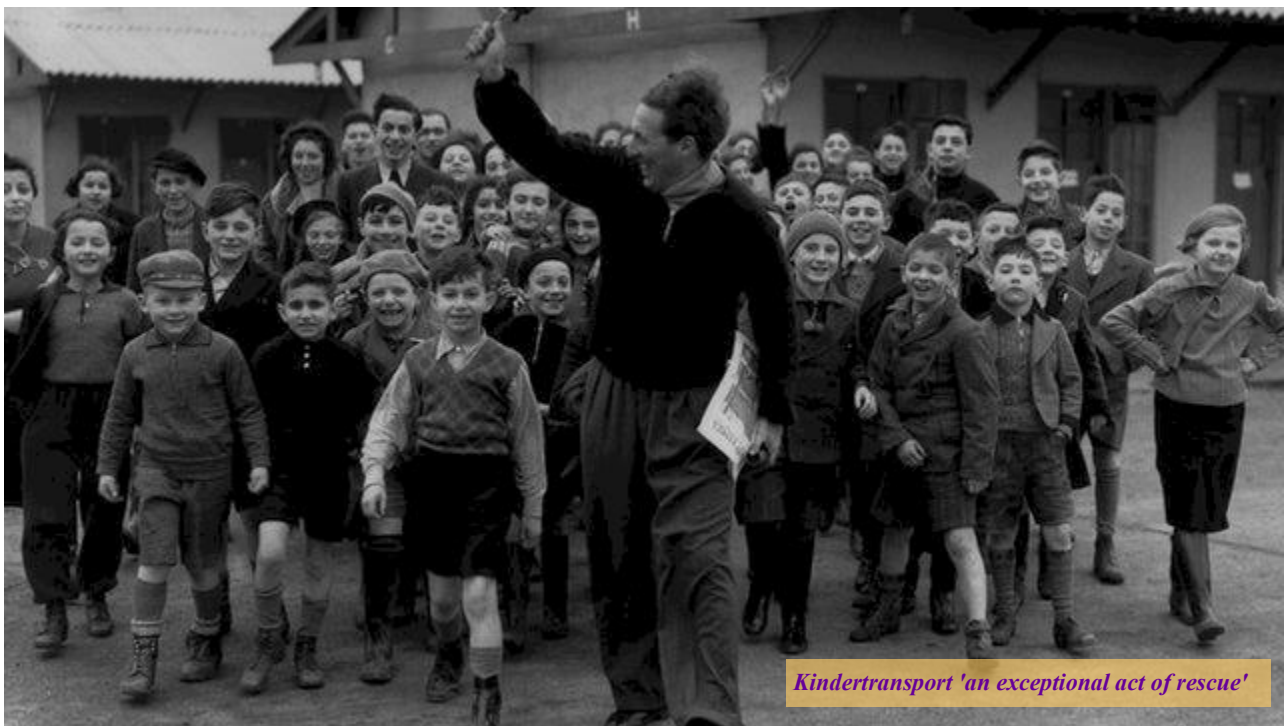
Kindertransport 'an exceptional act of rescue'

Folks at Beth Israel encourage us to join them for this service and program. This is a unique opportunity for some of us to thank some of their members in person for their generosity to us during our 3 year stay in their Minnie Brown Center. A signup sheet will be available at our visitors' table so those planning to attend can let us know they are coming, and we can plan for an appropriate hospitality event.