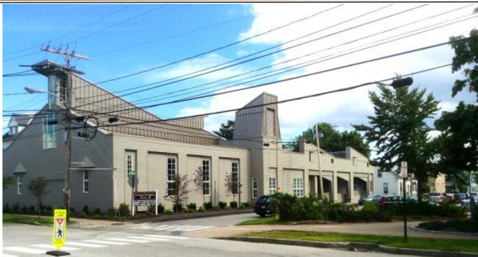
SUNDAY SERVICES AT 10 A.M.

November 2. All Souls Day —DAYLIGHT SAVING TIME ENDS. REMEMBER TO TURN YOUR CLOCKS BACK ONE HOUR BEFORE YOU GO TO BED.