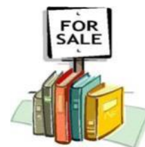
Book & Rummage Sale Saturday, March 28