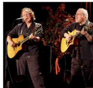
Aztec Two-Step Friday, April 24th