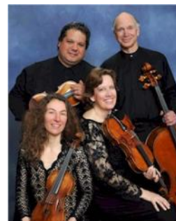
Daponte String Quartet Sunday, November 30th