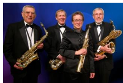
Cul de Sax Saturday, Feb 7