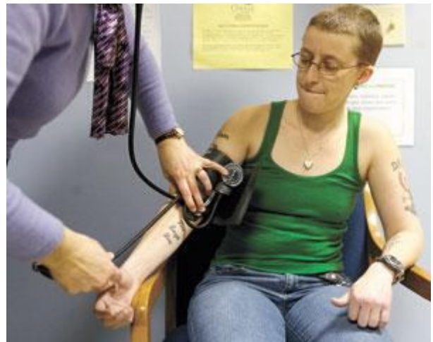
Oasis Health Network

Oasis Health Network in Brunswick is our December Charity with Soul. They offer free, quality health care services for the uninsured of greater Bath-Brunswick. Established in 1995, and a nonprofit organization, Oasis clinics offer health, dental and prescription assistance to uninsured low income adults. Oasis depends solely on grants and donations from local businesses and individuals as well as annual support from the United Way of Midcoast Maine. For more information contact them at 721-9277 or visit them online at www.oasishealthnetwork.org