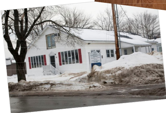
The Gathering Place 84B Union Street Brunswick